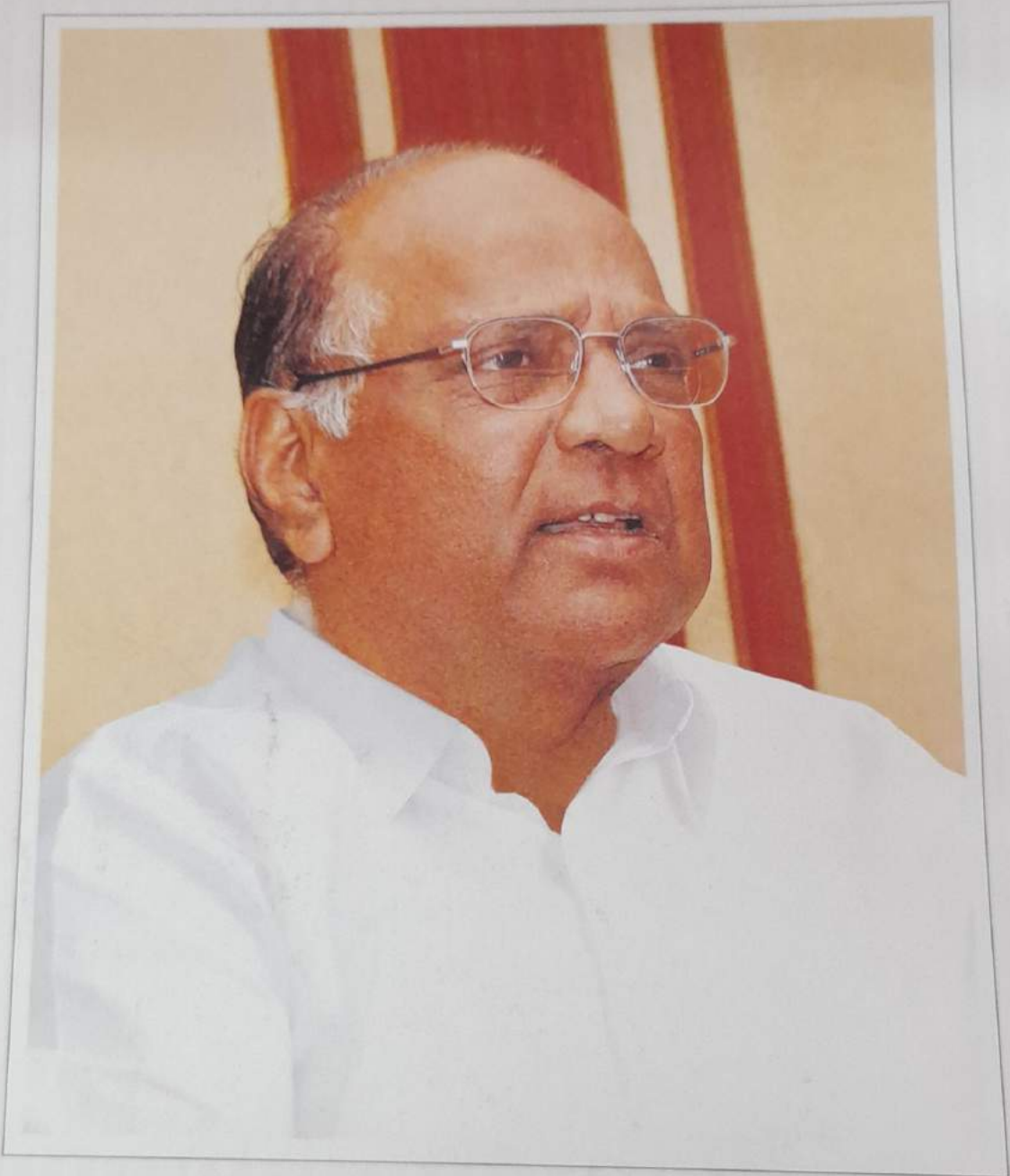
Hon'ble Sharad Pawar

Union Cabinet Minister Agriculture & Food Processing Industries Government of India