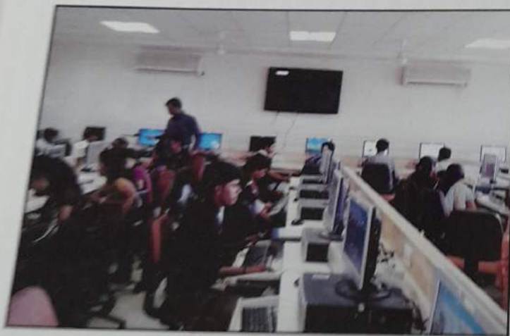
पॅक्टीकल करताना विद्यार्थी