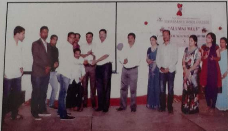
संगणकशास्त्र विभाग : माजी विद्यार्थी मेळावा