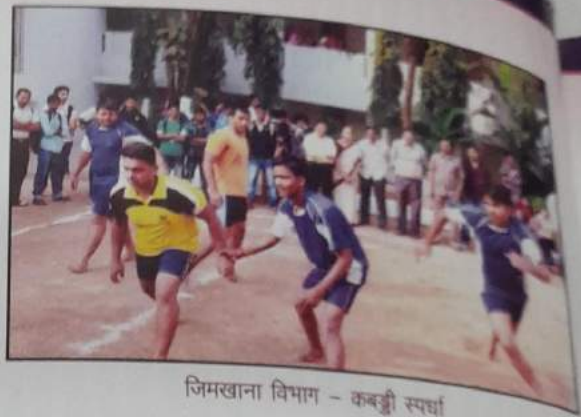
जिमखाना विभाग - कबड्डी स्पर्धा