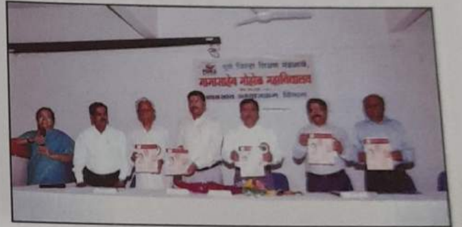
'युवाविश्व' नियतकालिक प्रकाशन