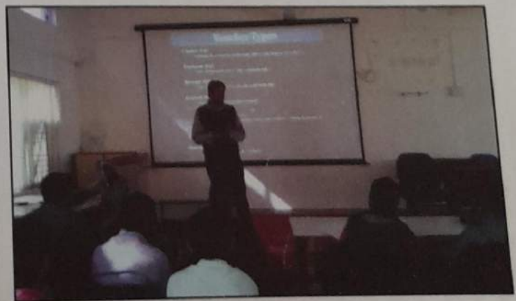
वाणिज्य विभाग : प्रात्याक्षिकाचे मार्गदर्शन करताना विद्यार्थी