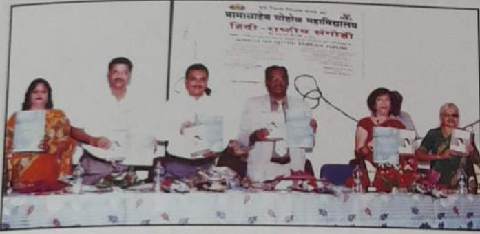
हिंदी विभाग-राष्ट्रीय चर्चासत्र