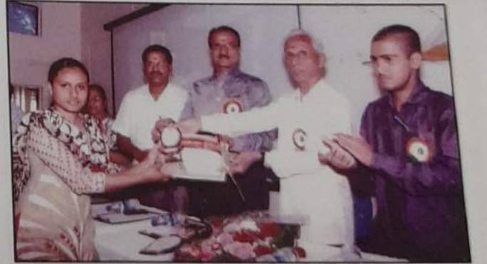
वार्षिक पारितोषिक वितरण समारंभ