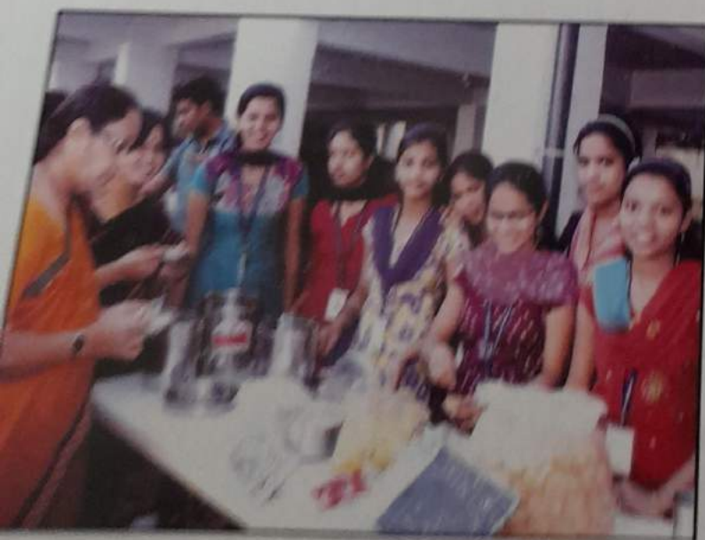
फलकअर मध्ये सामील विद्यार्थिनी