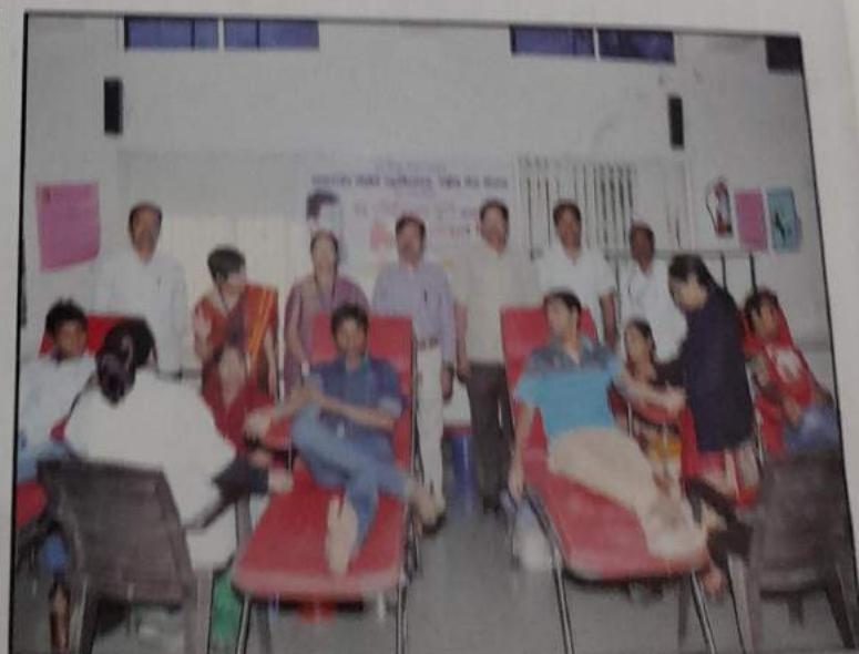
राष्ट्रीय सेवा योजना आयोजित शिबीरात स्वतःदान करताना विद्यार्थी