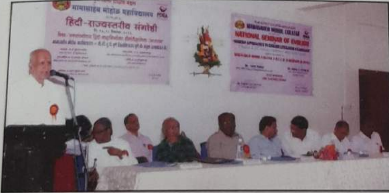
इंग्रजी विभाग : राष्ट्रीय चर्चासत्र