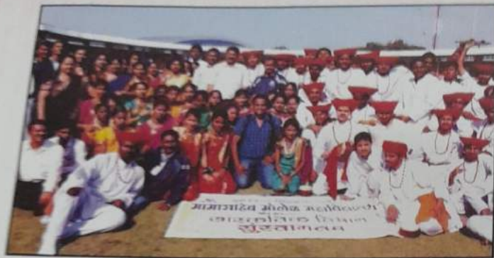
बालेवाडी क्रीडा स्पर्धात उद्घाटनपर सांस्कृतिक कार्यक्रमात सहभागी विद्यार्थी, प्राचार्य व प्राध्यापक वर्ग