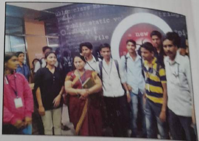
वाणिज्य विभाग आयोजित स्टडी टूर