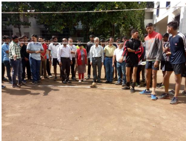
Intercollegiate Football Competition