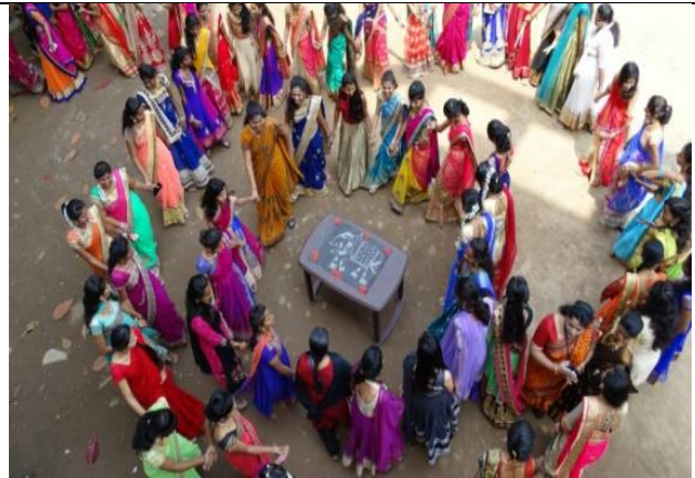
Every year Mahabhondla is celebrated in college area.