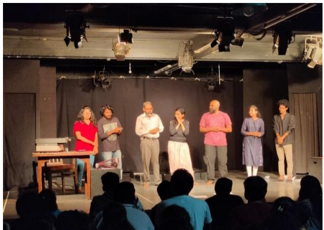
One act play “Pratigandhi”