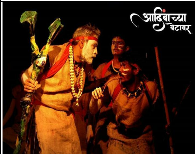
Documrntary on "Adibanchya Betavar"