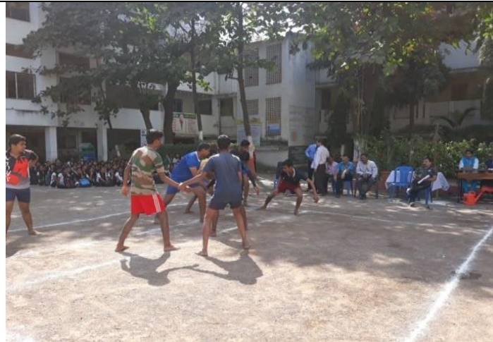
Intercollegiate Kabaddi Competition