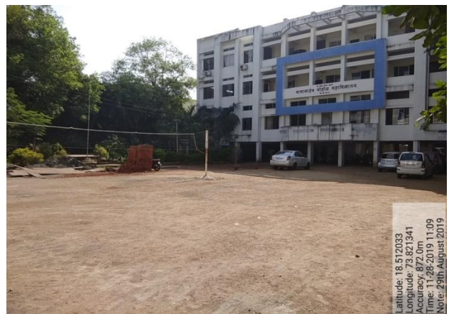
Intercollegiate Volleyball Ground