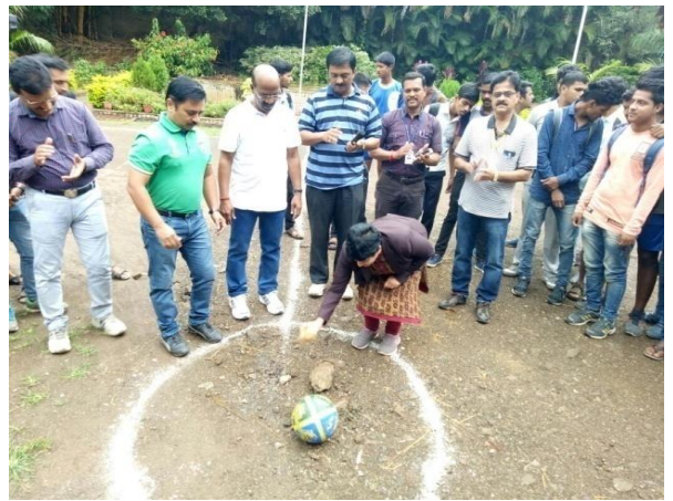
Intercollegiate Football Competition