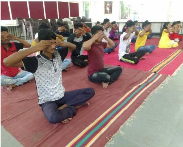
Every year Yoga day is celebrated in Seminar Hall