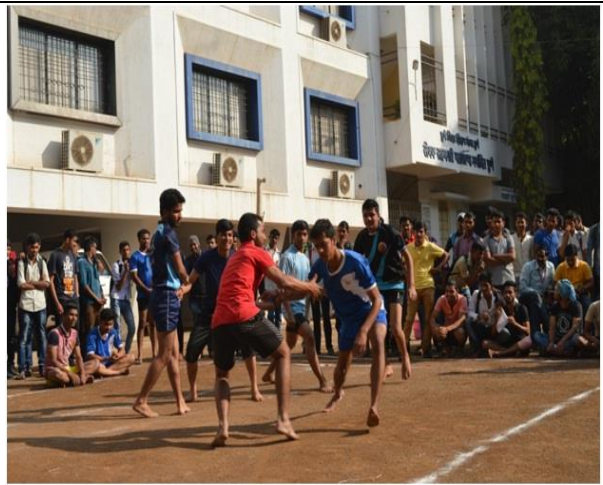
Intercollegiate Kabaddi Competition